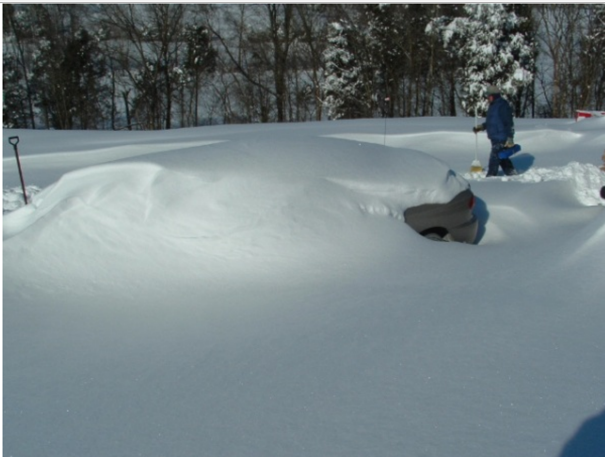
A car buried in snow in Milltown, Indiana.

During the 2004 snowstorm snow fell in southern Indiana at rates of as much as four inches per hour with storm totals as high as 32 inches and drifts to five feet. In Louisville, six inches of sleet combined with several inches of snow. Power was out for two days to 33,000 Louisvillians. Thundersnow and thundersleet were observed during the height of the storm. Farther south in central Kentucky, freezing rain deposited an inch of solid ice on all exposed outdoor objects, causing some roof collapses.