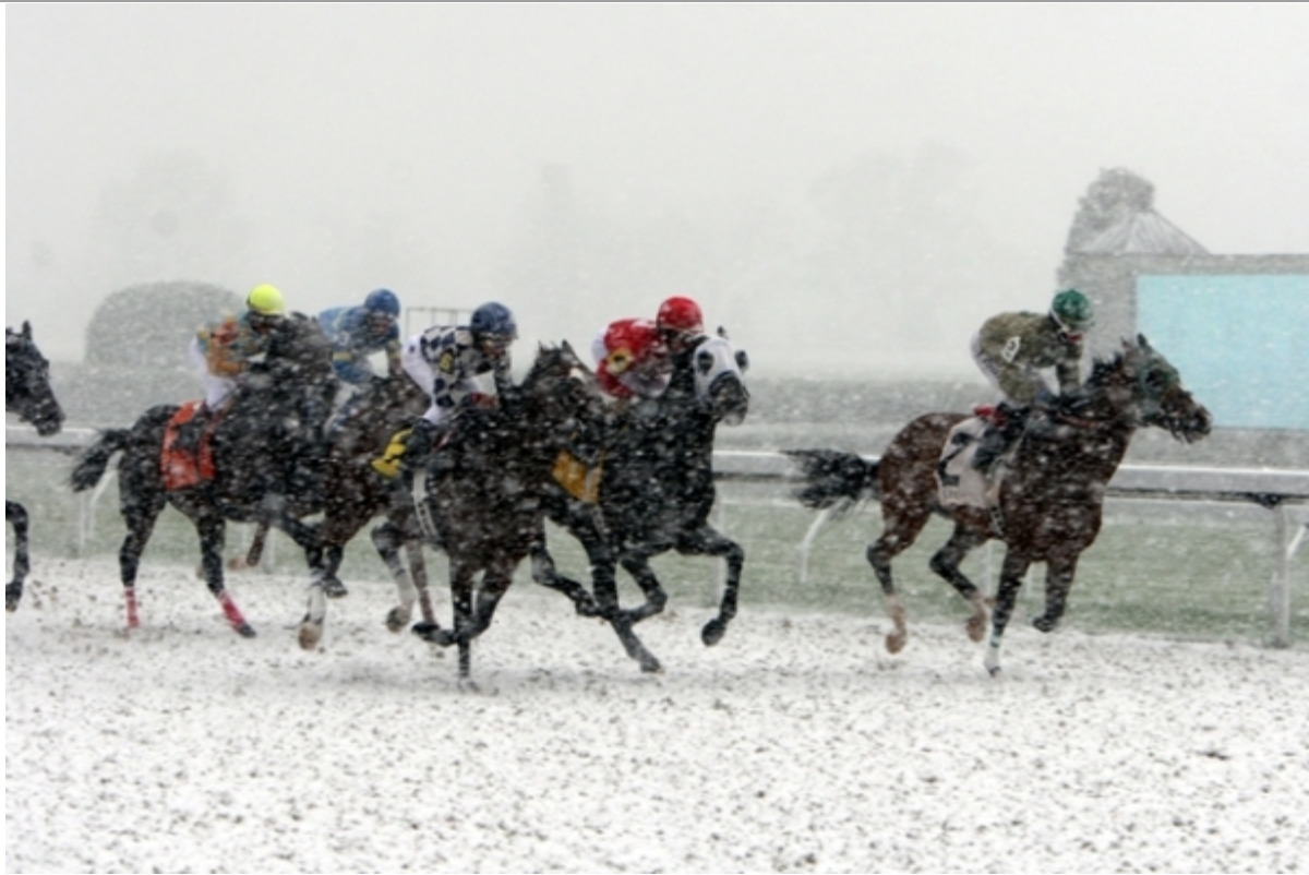
Record daily snowfall on April 6, 2007, for Opening Day at Keeneland Race Track in Lexington.

The last ten days of March 2007 had been unusually warm, with high temperatures in the 70s and 80s each day. A cold front passed through the region on April 3, which brought extensive severe weather and also ushered in a massive dome of frigid Canadian air. From the 5th to the 10th of April temperatures dropped into the 20s and 30s each morning throughout the entire region. Bowling Green spent a total of 47 hours (non-consecutive) below freezing, bottoming out at 22 degrees on the 8th. Louisville fell to 25 on the 7th and Lexington dropped to 22 degrees on both the 7th and 8th.